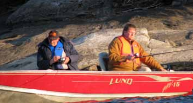
Meet New Friends - Whiteclay Lake