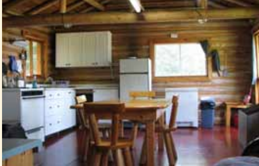
Spacious Kitchen - Pickett Lake