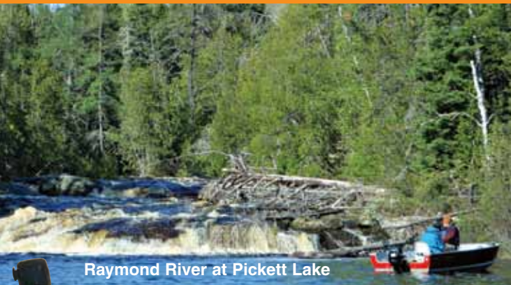
Raymond River at Pickett Lake